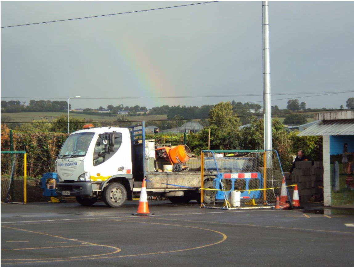
Hedging to be planted in Spring.